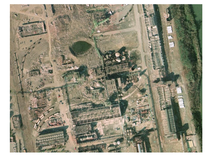
Figure 3: The area affected by the explosion

http://en.azf.fr/the-disaster/september-21-2001-800283.html [EMARS Accident # 403.]